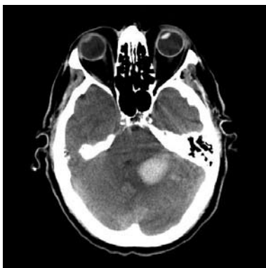
Fig. 3. Axial image of cerebral non-contrast CT shows a left anterior-inferior cerebellar haematoma in the parafloccular region, measuring about 2.5 cm in its largest diameter, with a mild “mass effect”, brainstem distortion and shift of the fourth ventricle to the contralateral side.

circular canals. The canalogram, displayed in the top-left corner of the screen, quantified the percentage of canal paresis (normal values: from 0% to 35% for the lateral canal and from 0% to 40% for the vertical ones) (Fig. 2). Because of the negativity in video-HIT, the directional preponderance, the persistence of vertigo with nausea and a slight headache, the disease was likely to have had a central cause. A cerebral computed tomography (CT) demonstrated a left anterior-inferior cerebellar haemorrhage that was deforming the brainstem and the fourth ventricle to the opposite side (Fig. 3). Diffusion-weighted brain magnetic resonance imaging (MRI) confirmed cerebellar vascular disease (Fig. 4). The patient was immediately transferred to the Neurosurgery Unit and underwent surgical posterior craniotomy. A follow-up MRI showed no further