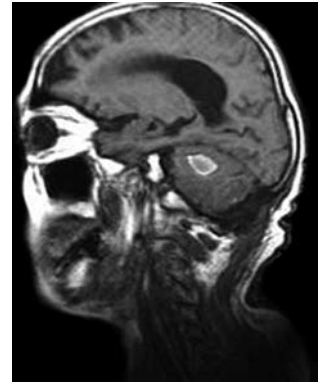
Fig. 4. T1-weighted sagittal image of brain MRI shows a cerebellar haematoma with a hemosiderin ring suggesting subacute haemorrhage.

progression of cerebellar haemorrhage. Six-months later, the patient was well, without any neurologic deficits.