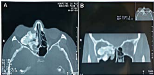
Fig. 1. Preoperative CT. A, axial view: 4 × 4.5 cm right ethmoid polylobulated lesion. B, coronal view: the lesion extended from the right frontal sinus floor to the right sphenoid sinus, and grew superiorly and posteriorly into the right orbit.

The defect was reconstructed immediately. Temporal fascia was used in dural reconstruction. Two autogenous bone grafts obtained from calvarial bone were used to reconstruct the medial and orbital floor, with the additional use of a titanium mesh. A galeal-pericranial flap was used to cover the floor of the anterior cranial fossa. The fronto-orbital bar was replaced using 15 mm titanium mini-plates. Epidural and subgaleal drains were placed (Fig. 2).